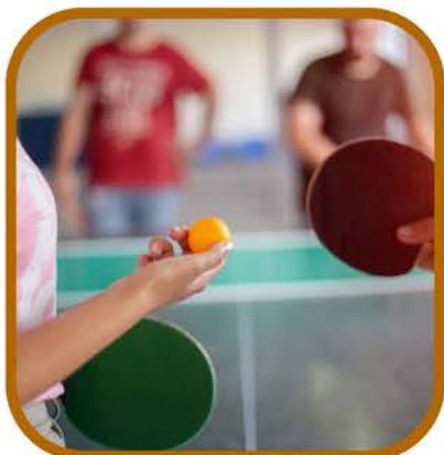
Table Tennis Club

1 st & 3 rd Thursday | 1:30-3:30pm | Garry Oak Room