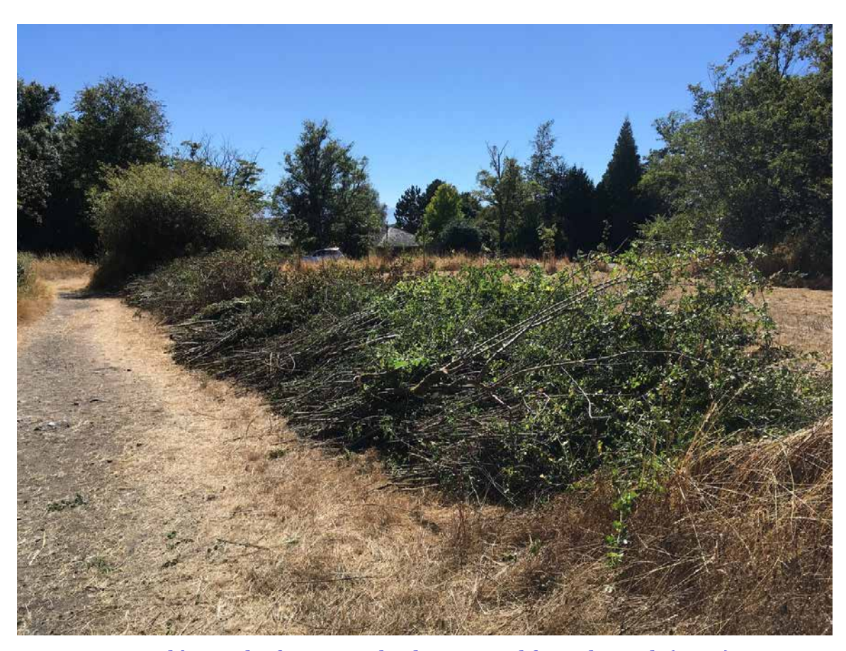
Figure 8—A week's worth of invasive shrubs removed from the park (2018)

While putting out fires in the park must always remain the overriding priority, there are opportunities for minimizing damage to the park's most endangered natural values by providing the fire department with a map of sensitive areas in the park. This has been done in the past, and these maps should be updated periodically, and a short tour through the park with the fire chief organized from time to time.