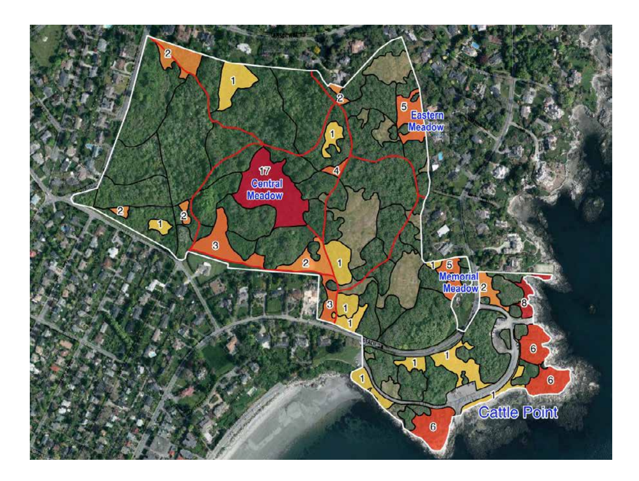
Figure 4—Number of rare plant species per meadow in Uplands Park and Cattle Point Cattle Point and Uplands Park are home to a total of 24 rare and endangered plant species; with 22 in Uplands Park and 11 in Cattle Point. Numbers shown are for rare plant species currently known to occur in different areas of the park.