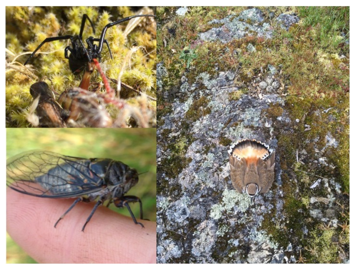
Figure 6—Fauna at Uplands Park and Cattle Point

Clockwise from bottom left: The cicada Okanagana occidentalis, one of only two local species found in Northeastern Meadow (TU68); Western Black Widow Spider (Latrodectus hesperus) making a meal of a grasshopper in TU63; and Killdeer (Charadrius vociferus) at Cattle Point (TU92) protecting its ground nest of four eggs which can be seen at the top just off the centreline of the photo.