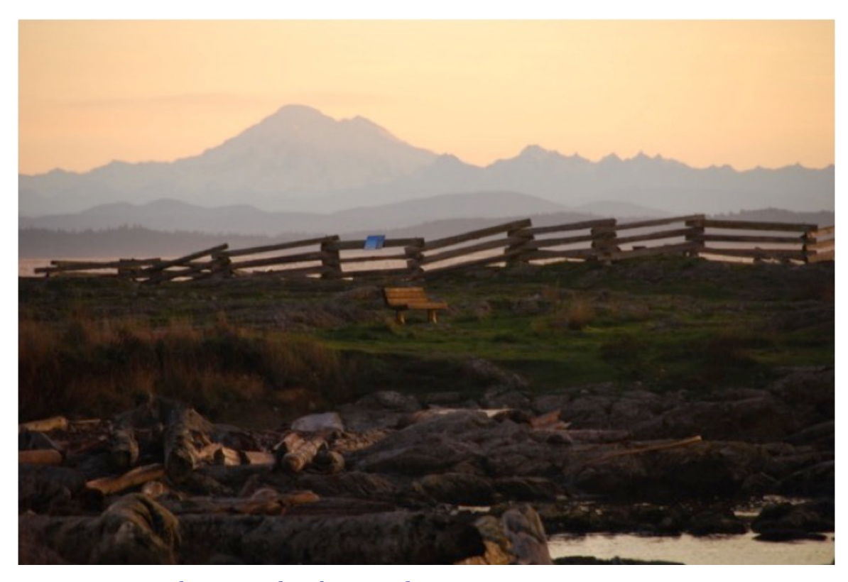
Figure 1—View of Mount Baker from Cattle Point

Uplands Park is bordered on three sides by an urban residential neighbourhood and on its southeastern end by Haro Strait. With an area of 31 hectares, it is the largest in Oak Bay's park system and accounts for more than 75% of the municipality's undeveloped natural parkland.