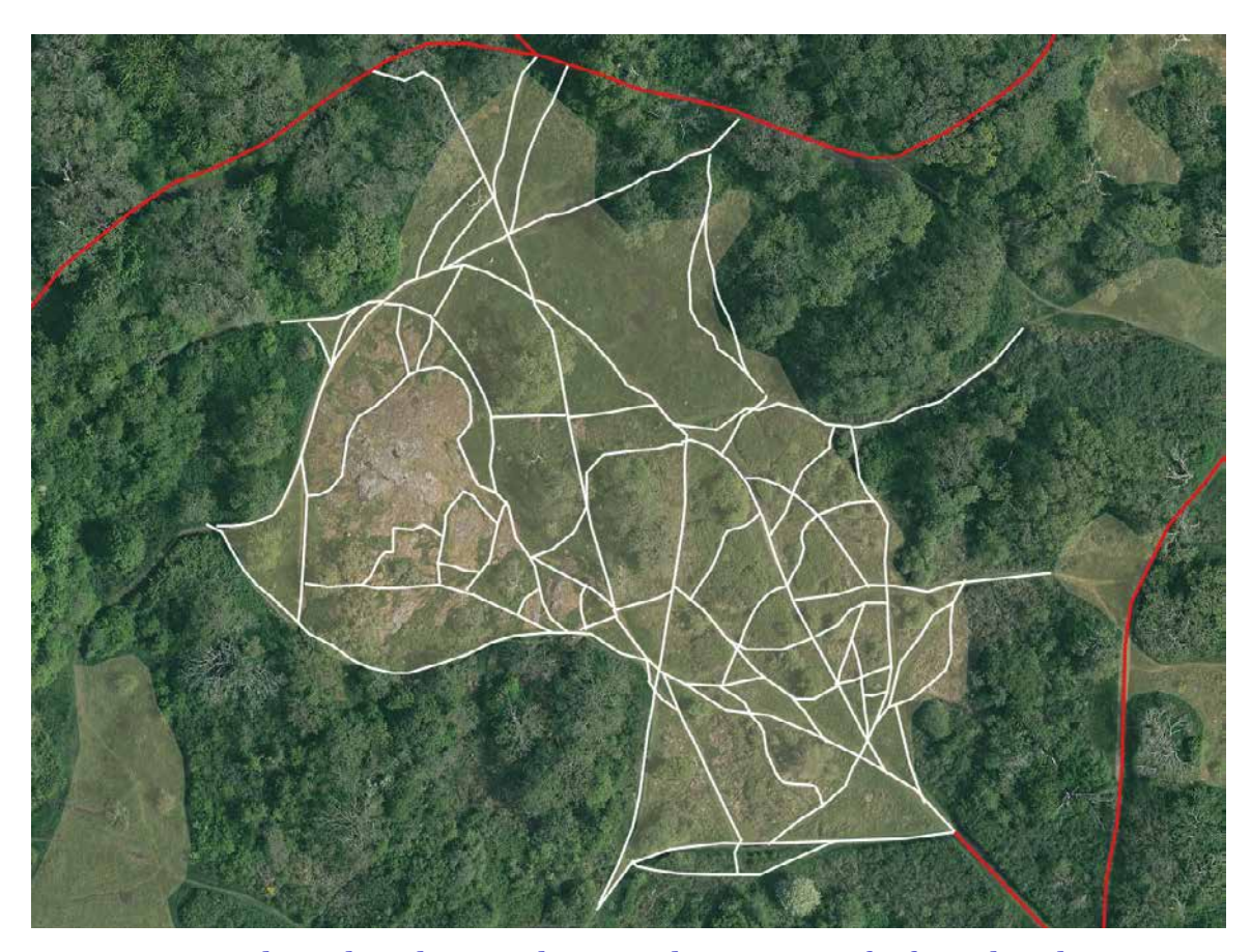
Figure 7—Central Meadow showing the more than 2000 m of informal trails

Dogs can also contribute to habitat loss when they are allowed to dig and run freely over sensitive meadow habitat or when their owners use meadows to play catch. Dog faeces left on site alter the chemical composition of the soil by adding nitrogen, which benefits exotic grasses such as Orchard Grass at the expense of native species, which are adapted to nitrogen-poor conditions (Garry Oak Ecosystem Recovery Team, 2011). A better system is needed for keeping dogs under control and out of the ecologically sensitive parts of the park, one that might include creating a fenced-in section in the park where dogs can run off leash all year long.