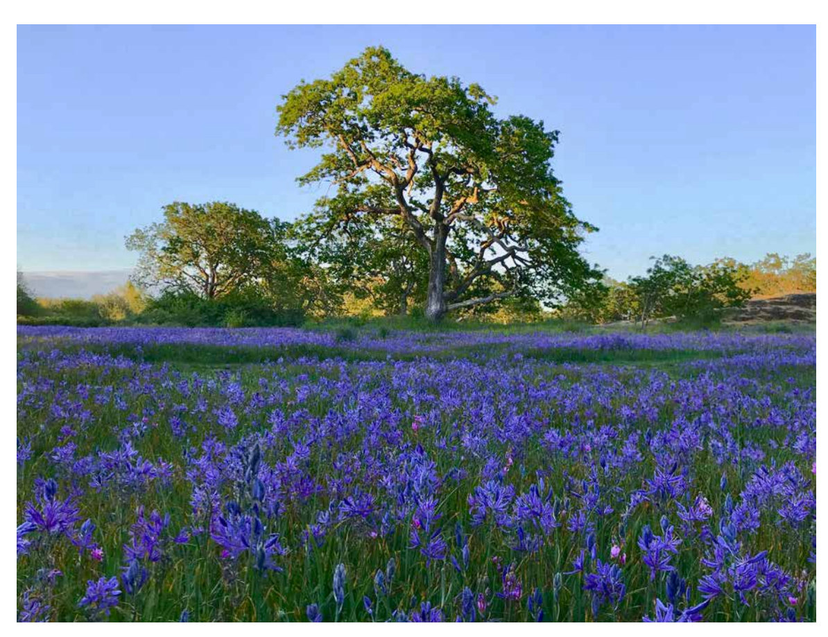
Figure 3—Central Meadow (TU62) in full camas bloom

Although Cattle Point is technically part of Uplands Park, where this document refers to Uplands Park it only refers to those portions of the park west and north of Beach Drive. Where it refers to Cattle Point, it only refers to the area east and south of Beach Drive. When addressing issues common to both units, it refers to them as 'Uplands Park and Cattle Point'.