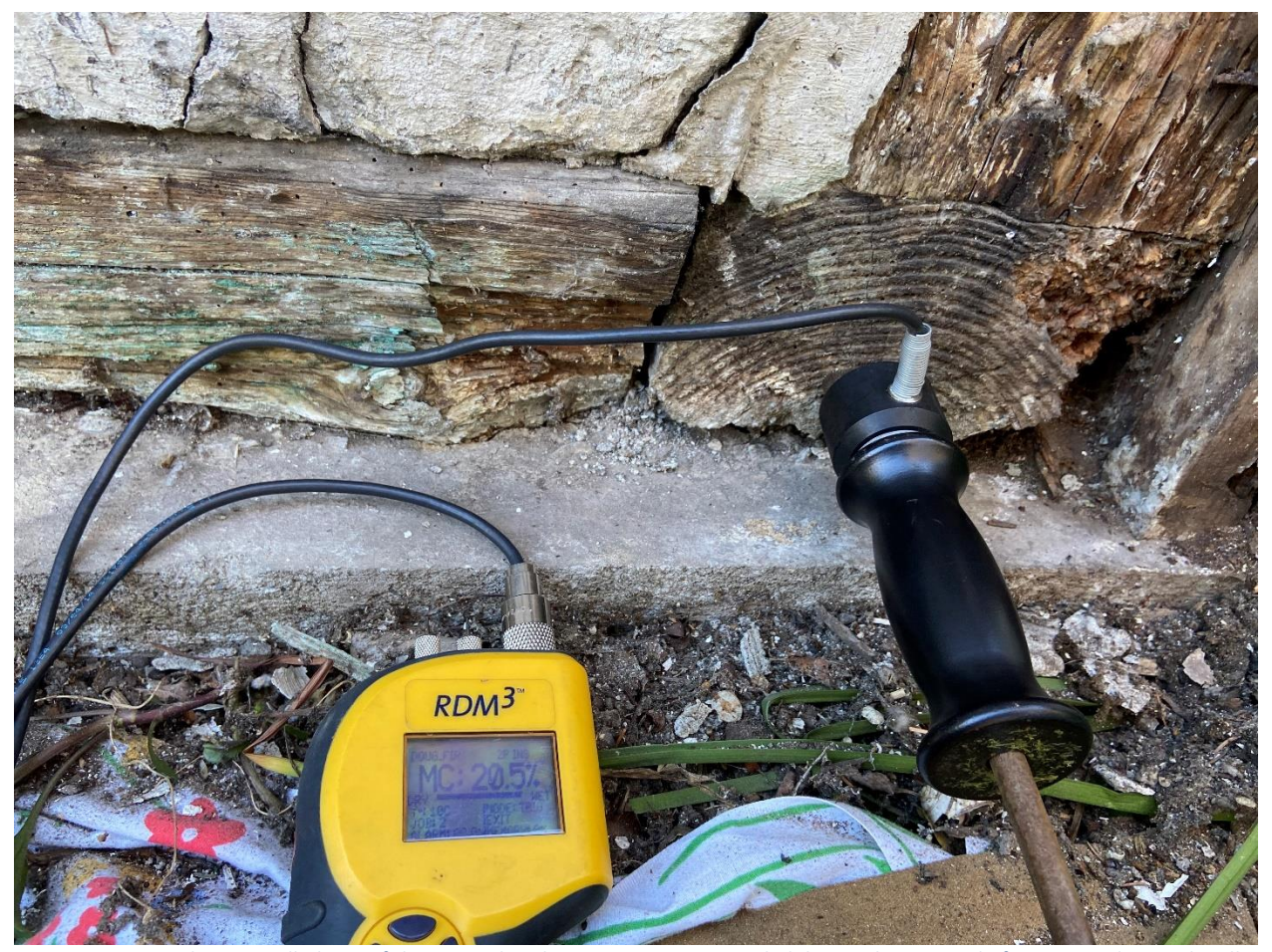
Figure 5 - Wet and rotting sill plates of the original timber structure are revealed during the removal of exterior siding and wall cladding below W6 in the oldest part of the building.