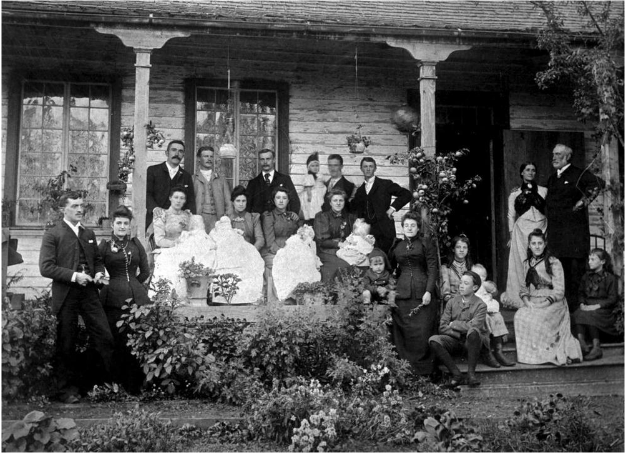
Figure 6 - Three generations of the Pauline family at Tod house in the 1890s. Note the wood posts and capitals, wood porch and steps, and plain transom light above the entrance door. J.K. Nesbitt collection. RBCMA A-08840

The following chronology represents our review of materials held in the Oak Bay Archives and the Royal BC Museum and Archives: