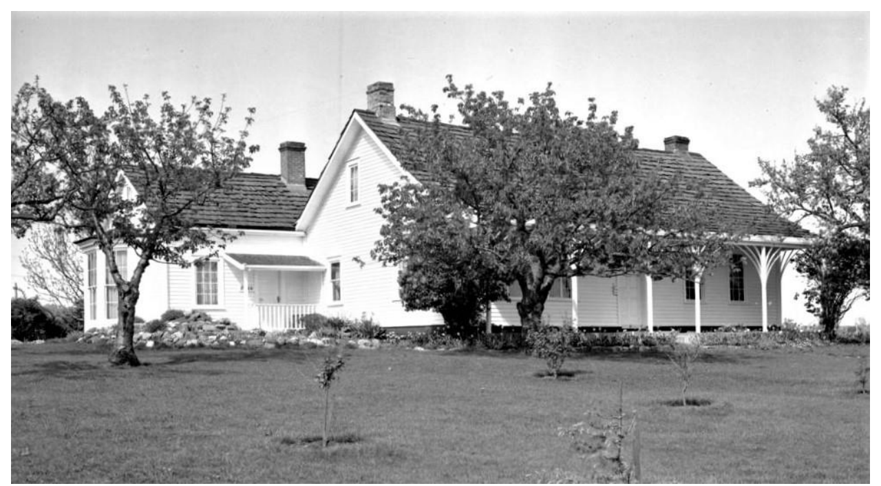
Figure 3 - Tod House circa 1953. Note the split shake roof and rear porch. NB this photo is misidentified in the RBC Archives as an image from 1934.