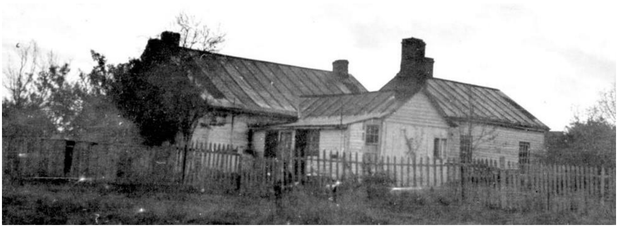
Figure 2 - The rear of Tod House in 1934. Note the tarpaper roofing laid over shakes.