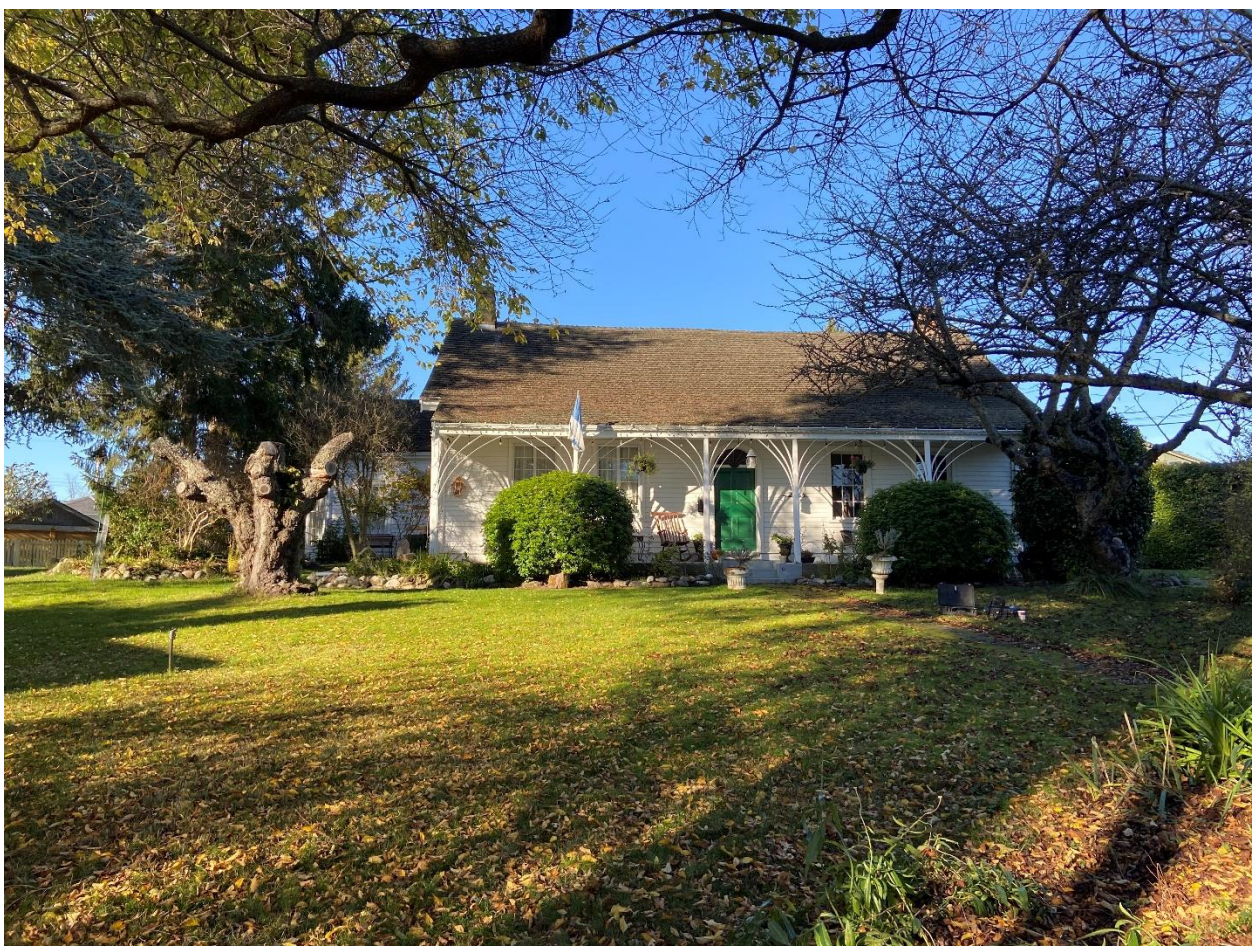
Figure 1 - House and garden if Tod House. October 2019. Heritageworks.