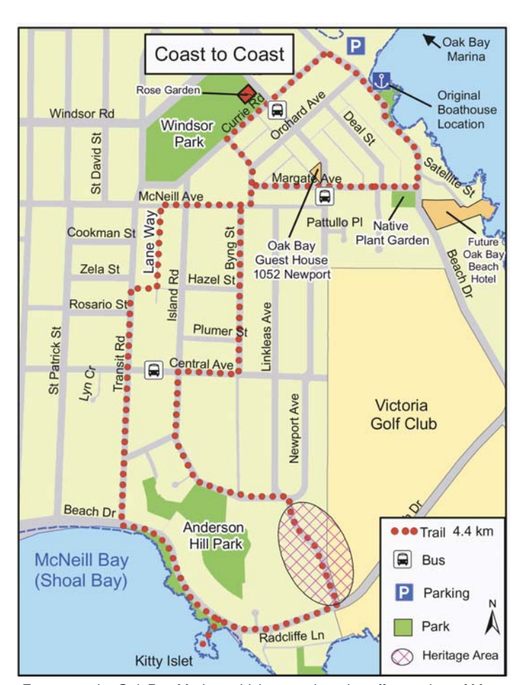
From near the Oak Bay Marina, which on a clear day offers a view of Mount Baker in Washington State, to McNeill Bay this 4.4 km trail connects two of Oak Bay's coastal areas.