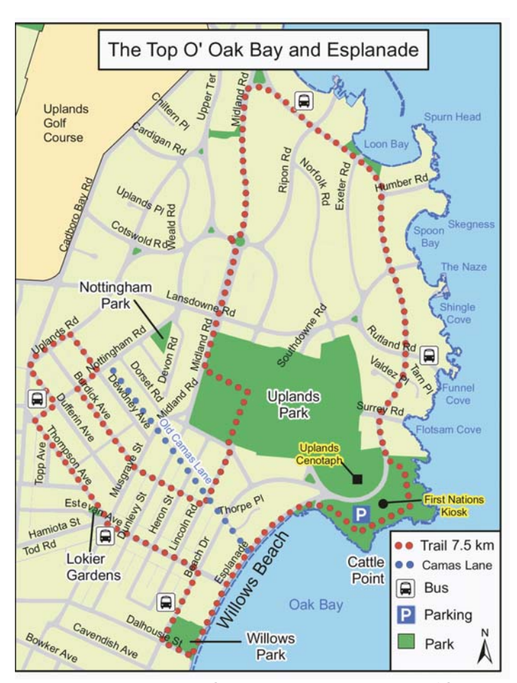
This trail travels 7.5 km along Oak Bay's coast and through two of Oak Bay's most well known green spaces, Uplands Park and Willows Park