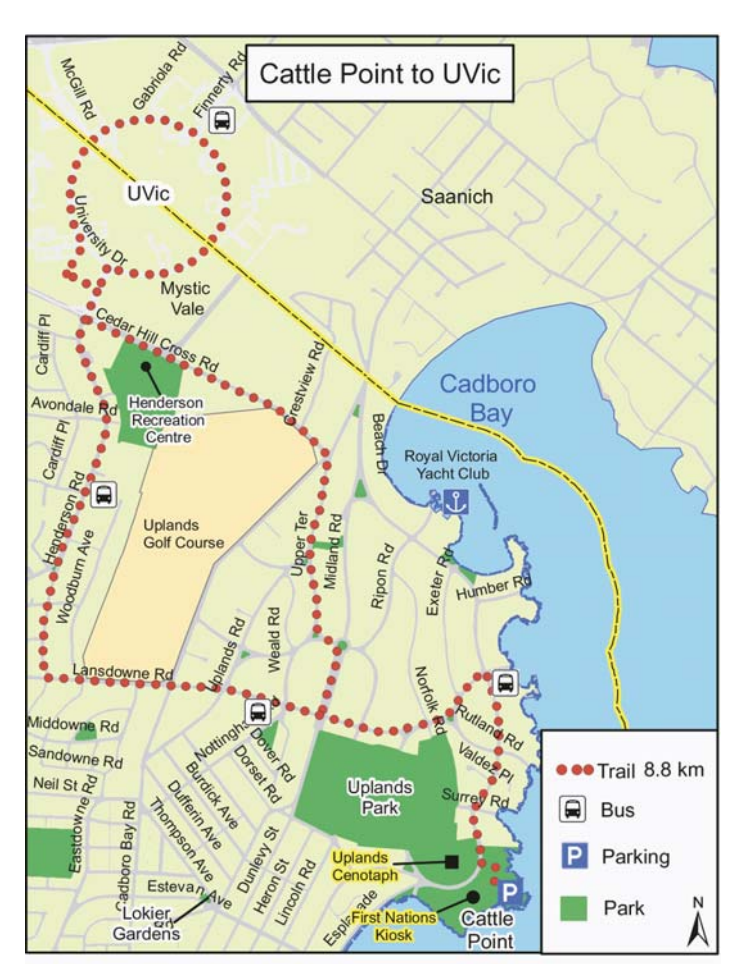
This 8.8 km trail travels through north Oak Bay, visits the excellent viewpoint at Cattle Point and circles the Uplands Golf Course.