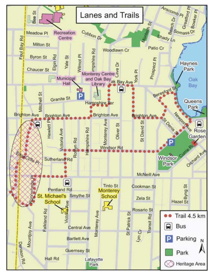
The back lanes and trails of Oak Bay are highlighted in this 4.5 km trail. However, walkers with an adventurous spirit can find many more unmarked pathways, back lanes and secret places to explore.