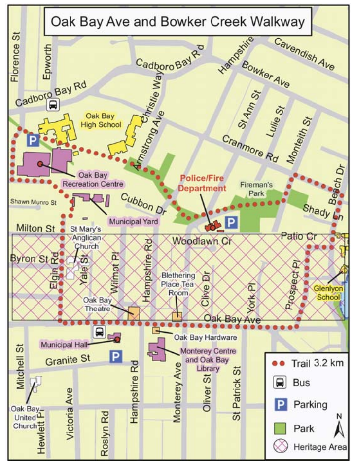
The Oak Bay Village and the Bowker Creek Walkway are featured in this 3.2 km trail through the heart of Oak Bay. Heritage areas contain a wealth of historically significant architecture.