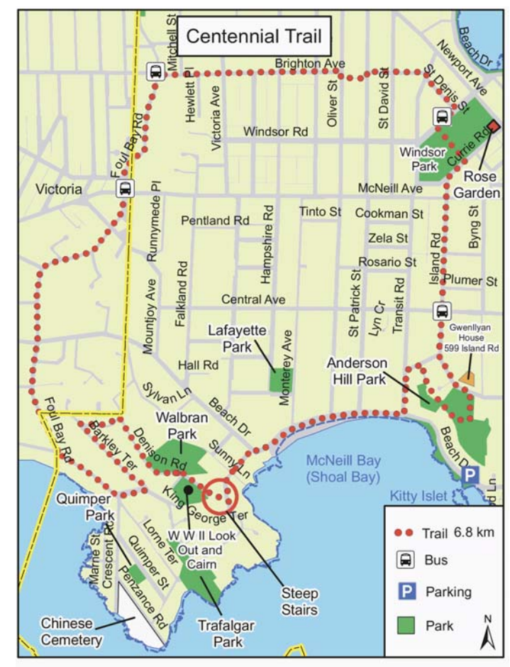
The Centennial Trail, a 6.8 km circuit through South Oak Bay, was designated as part of the Oak Bay Centennial celebrations in 2006 and is marked by 14 carved posts.