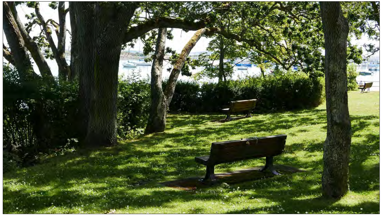
Haynes Park with Garry oak trees.