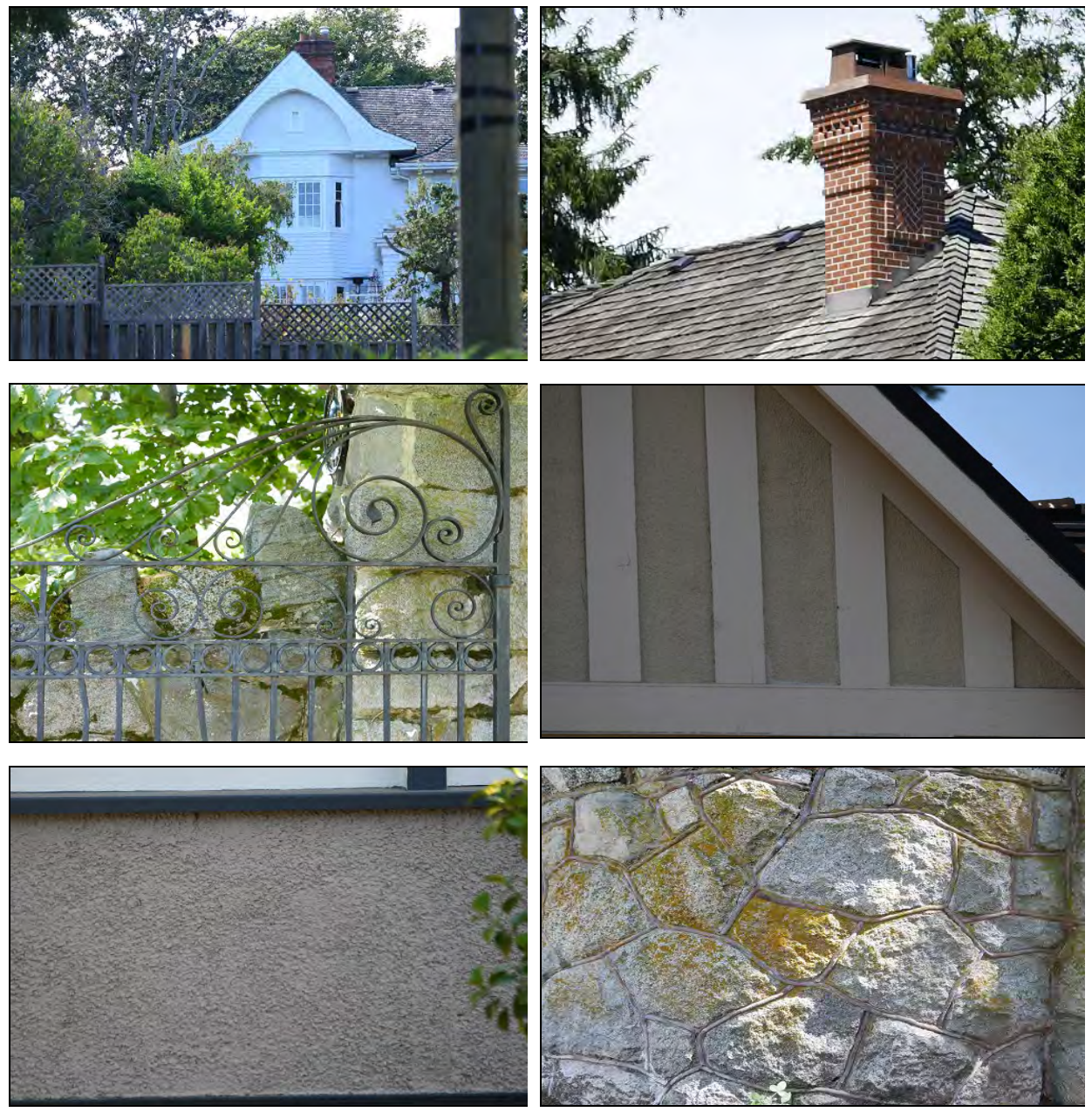
Examples of traditional materials used in The Prospect.