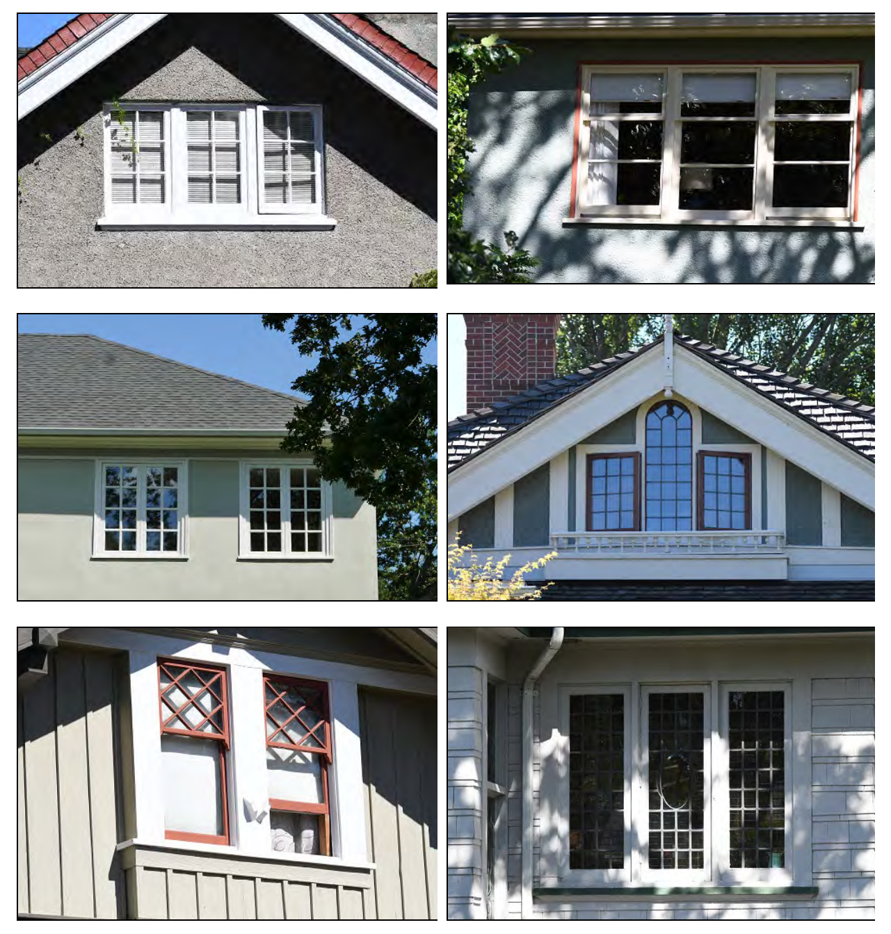
Examples of window types and patterns on existing buildings in The Prospect.