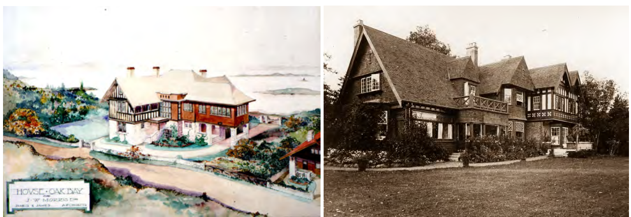
Watercolour by P. Leonard James (BC Archives PDP00576)

Each HCA is unique. They are designed to protect what a community values as special about a place and worth conserving for the enjoyment of future generations. Community heritage values are typically recorded in a document called a Statement of Significance (SOS). The SOS that has been created for The Prospect Heritage Conservation Area (The Prospect) explains why this neighbourhood warrants recognition as a historic place because of its unique combination of aesthetic, historic, social, environmental and educational values. The Prospect is one of Oak Bay's oldest neighbourhoods, and it contains a wonderful collection of historic homes created by some of BC's most prominent architects including Francis Rattenbury, Samuel Maclure and others.