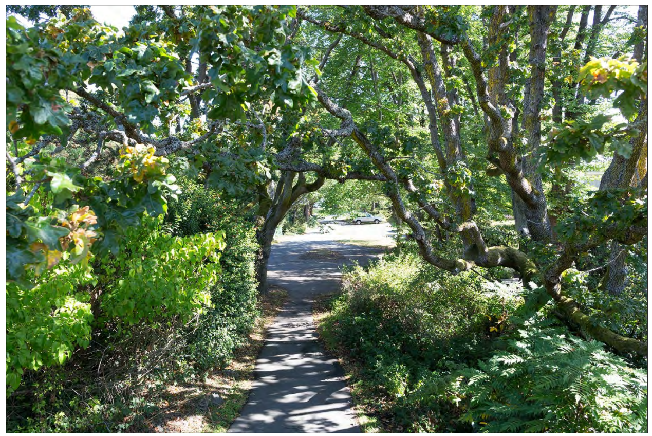
Native Garry oak trees bordering a pedestrian path in The Prospect neighbourhood.