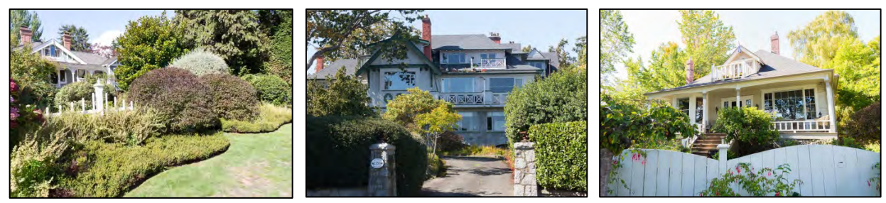
Some of the many historic homes in The Prospect.