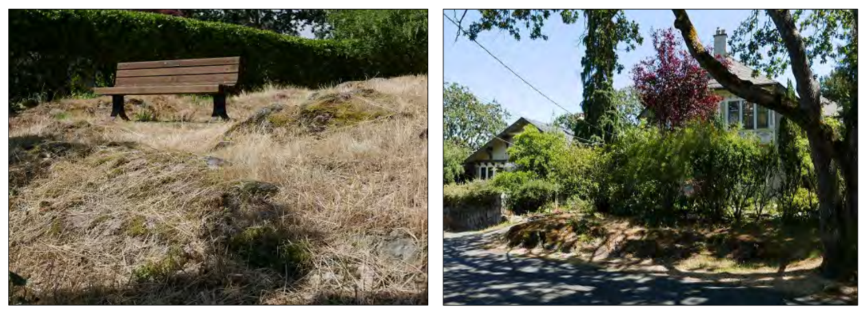
Integration of natural topography within the built environment of The Prospect.