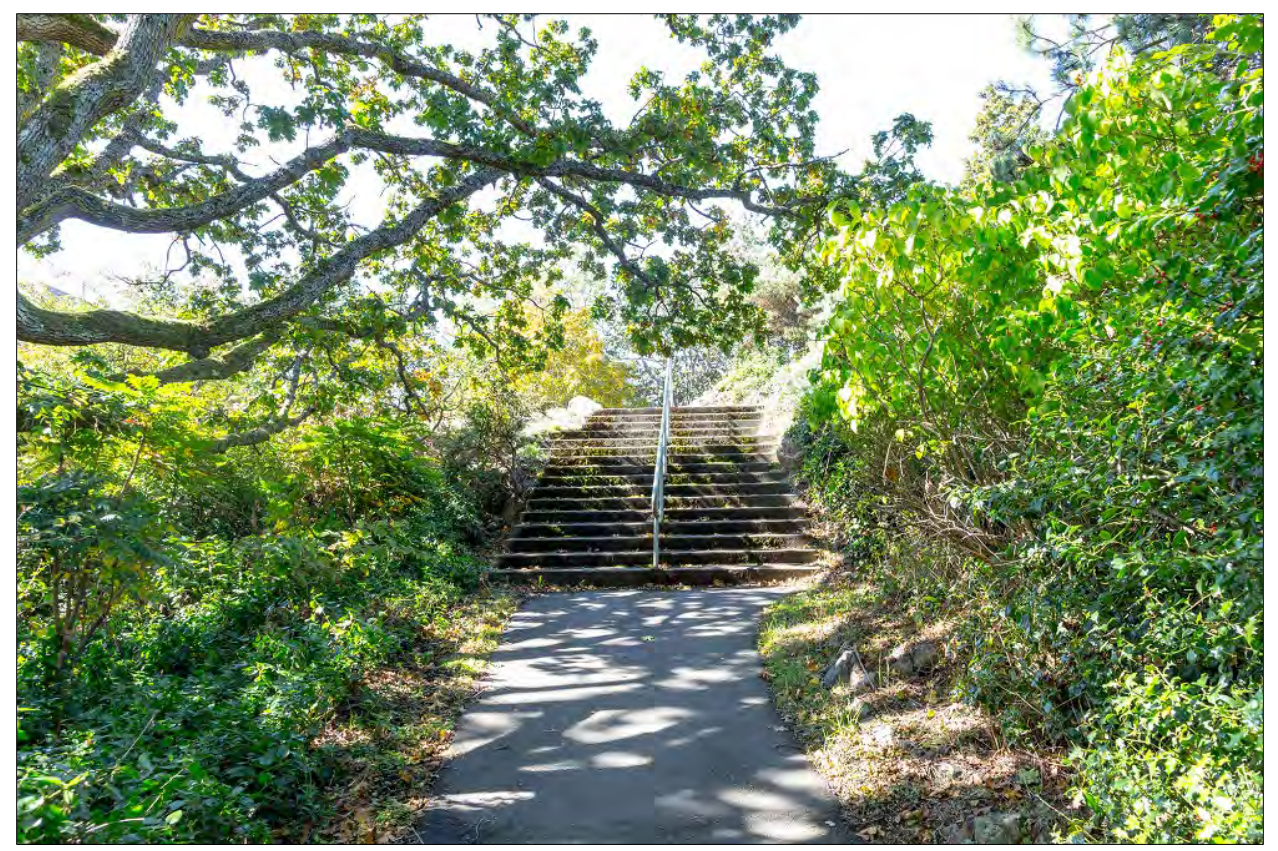
Example of an existing pedestrian thoroughfare leading to Haynes Park that exists in the open space between buildings.