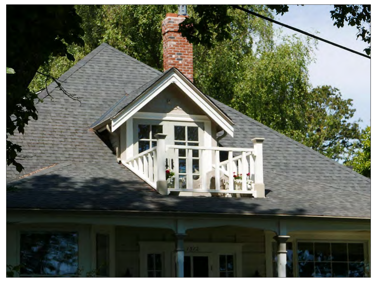
Example of a physically and visually compatible alteration to a protected building in The Prospect. The new dormer uses the same roof pitch as the original roof, and the architectural detailing is consistent with the original period of construction. The materials are also consistent with the original home.