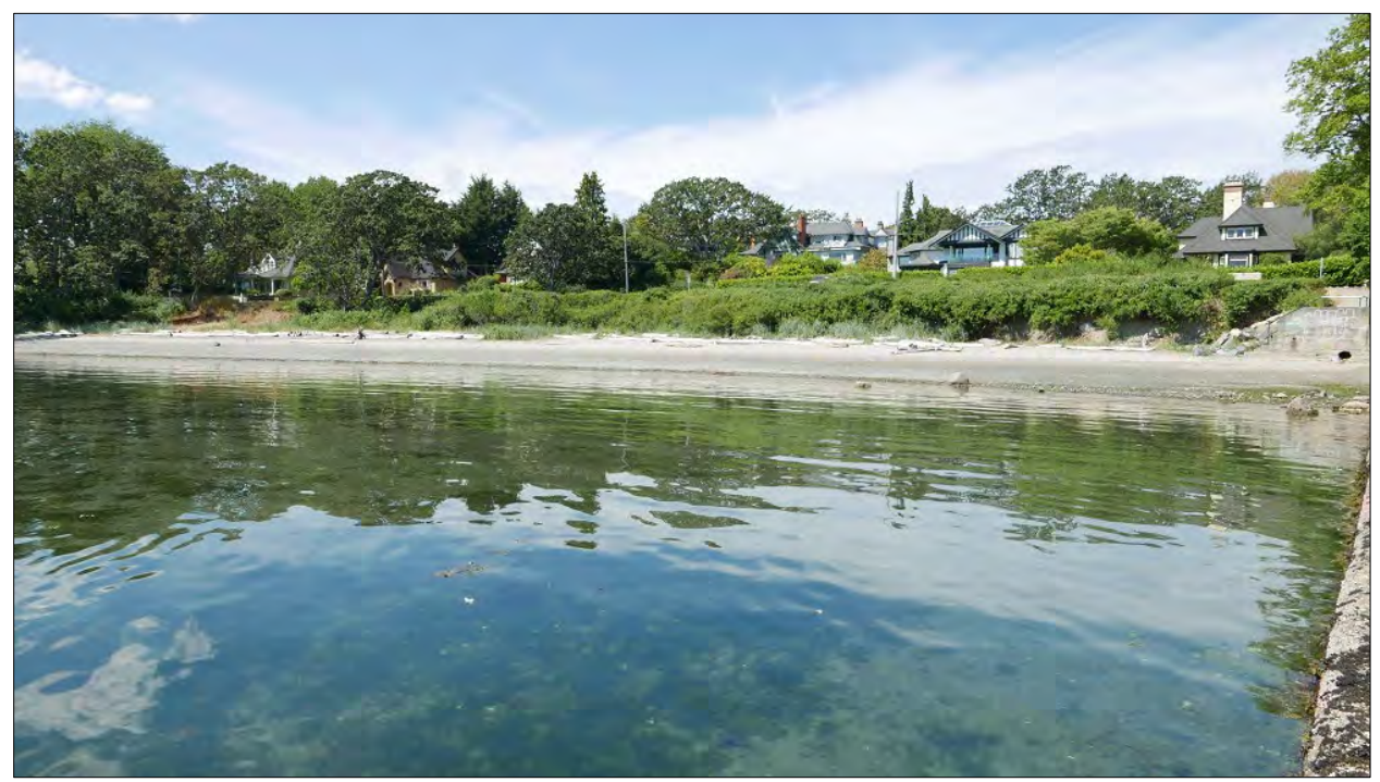
Shoreline of Rattenbury's Beach.