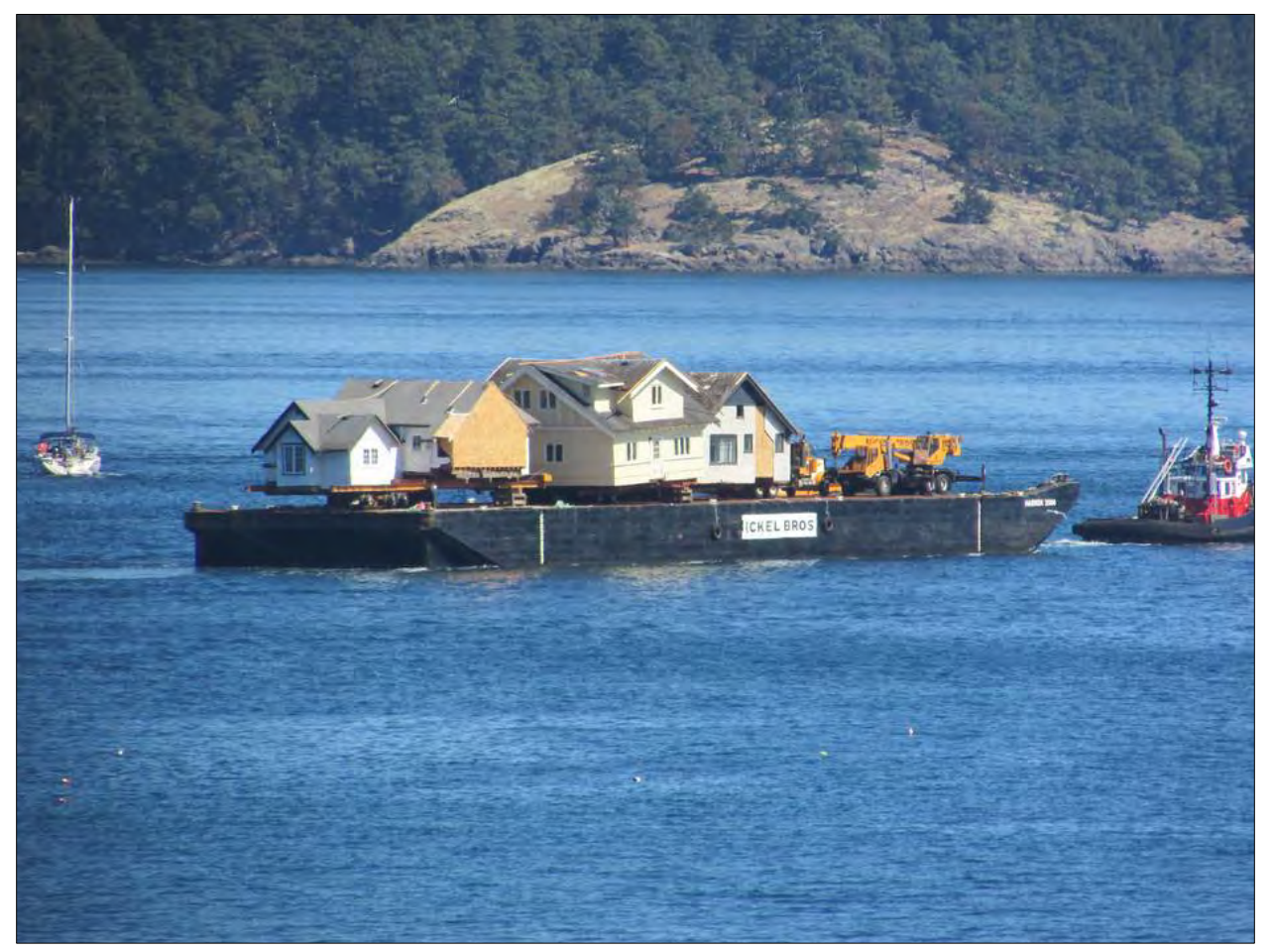
The removal of heritage from The Prospect will be regarded as demolition.

Demolition within The Prospect will not be permitted unless a building permit is approved by the District. The removal of heritage from The Prospect will be regarded as demolition.