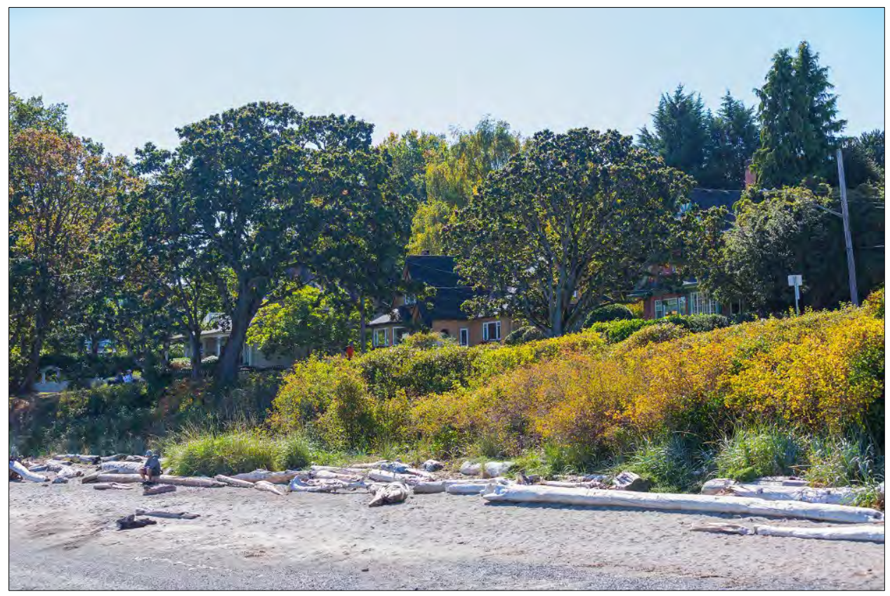
Trees, vegetation and shoreline at Rattenbury's Beach are examples of significant natural features and topography within The Prospect.