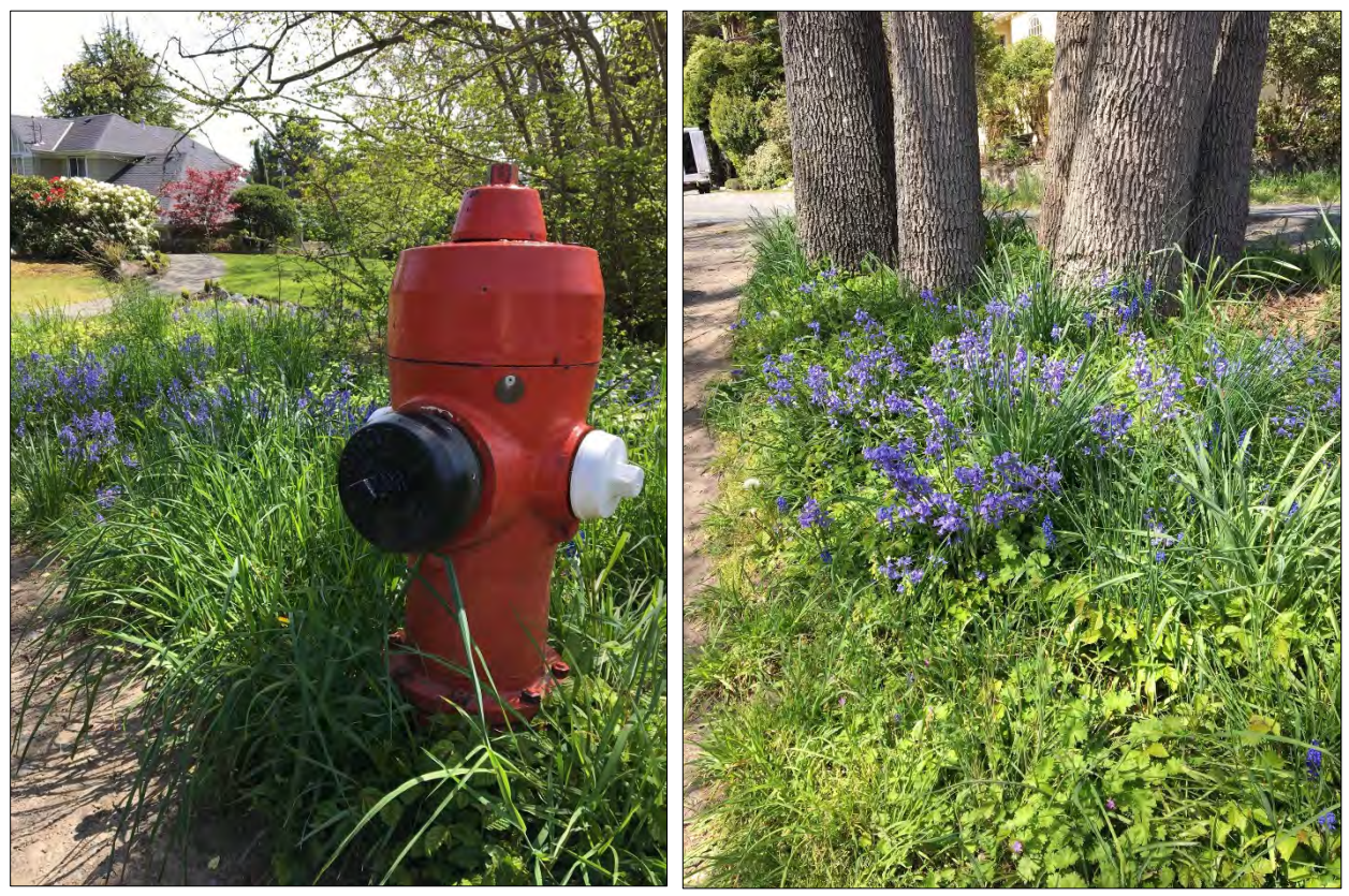
Examples of planted 'soft' boulevards with mixed vegetation and no curbs in the streetscape.