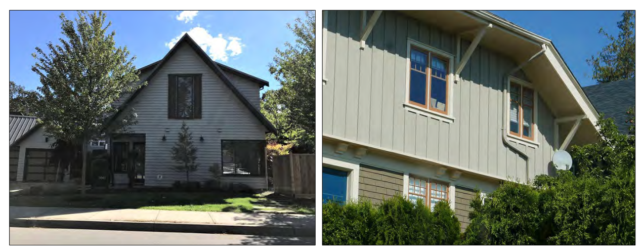
Examples of architectural detailing and forms that are complementary to the historic precedent. The example on the left uses contemporary design and traditional materials to achieve this, while the example on the right uses traditional design and traditional materials. Both examples are appropriate because the detailing is consistent with historic architectural styles in the neighbourhood.