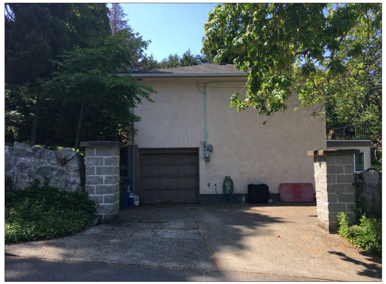
Example of inappropriate form, scale and massing (also demonstrating incompatible building materials, incompatible landscaping materials, an expansive and impermeable driveway and inappropriate door and window design).