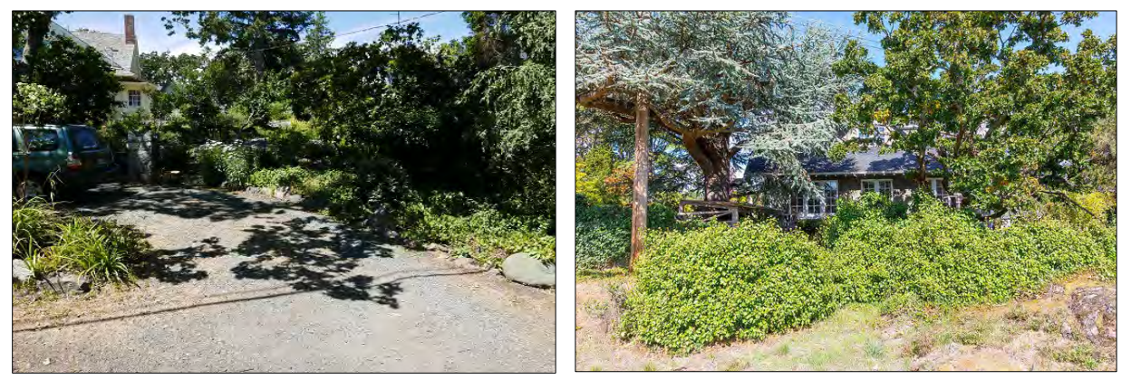
Natural materials such as gravel, stone and planted vegetation typical of the historic landscape.