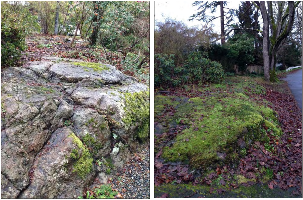
Examples of the bedrock outcroppings that characterize the topography of The Prospect.