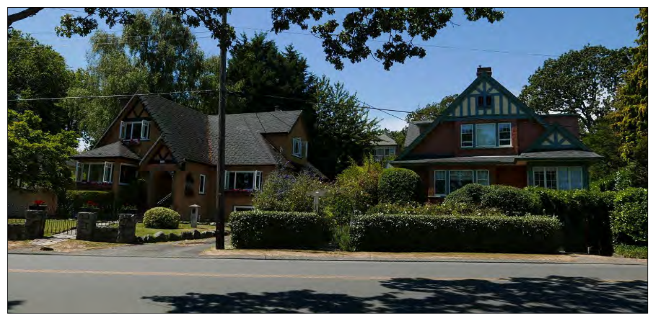
Examples of appropriate form, scale and massing.