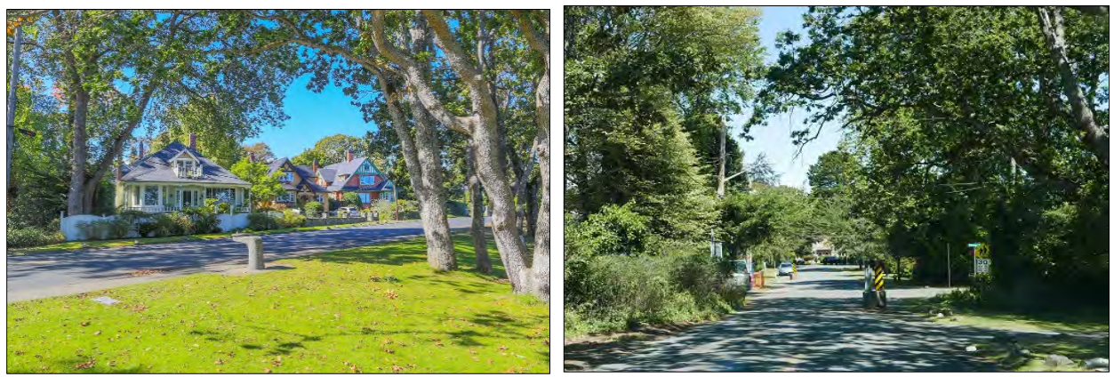
Examples of streetscapes within The Prospect showing wide boulevards and mature vegetation.