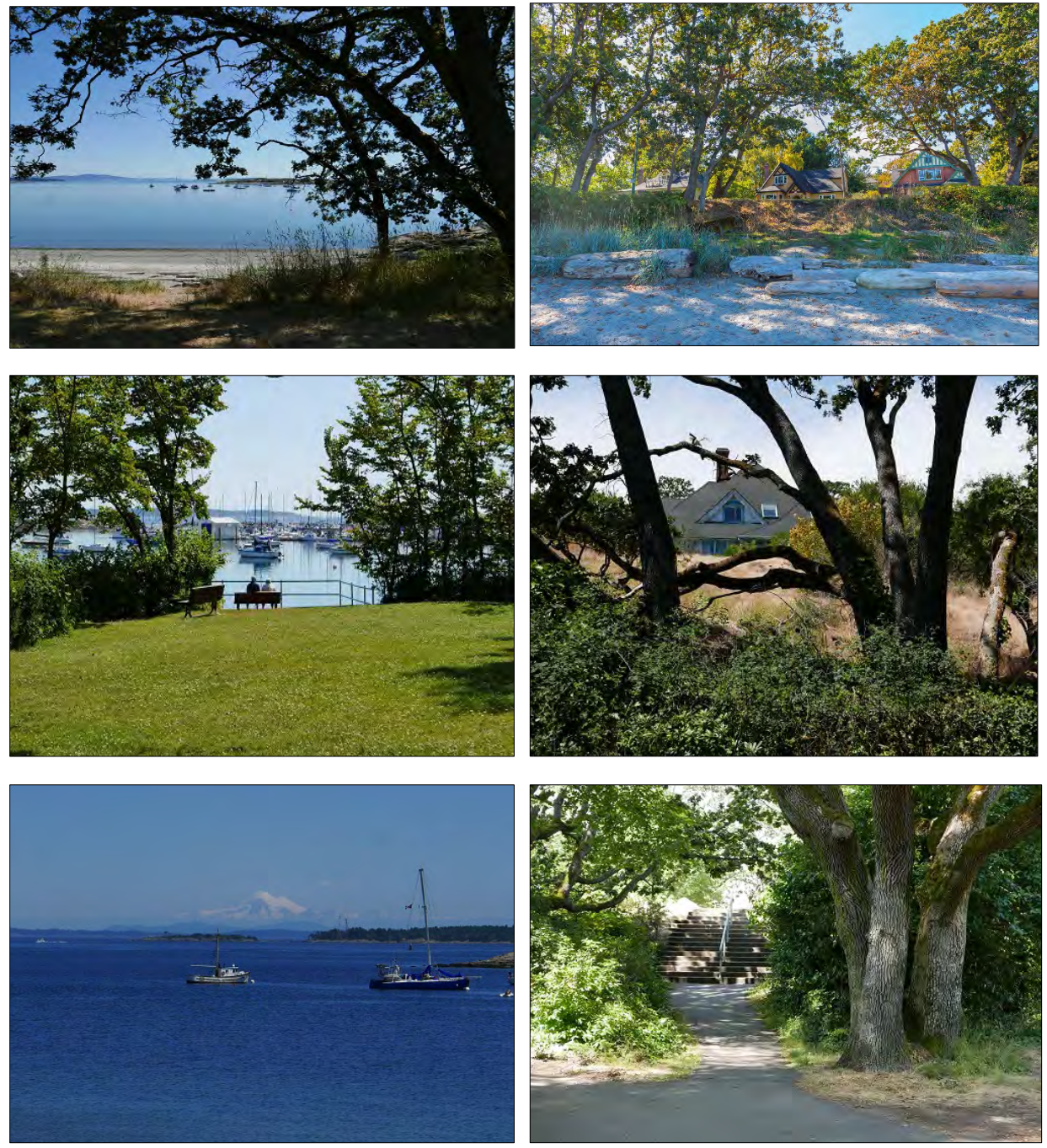
External and internal views in The Prospect demonstrating the importance of visual relationships to the character of the neigbourhood.