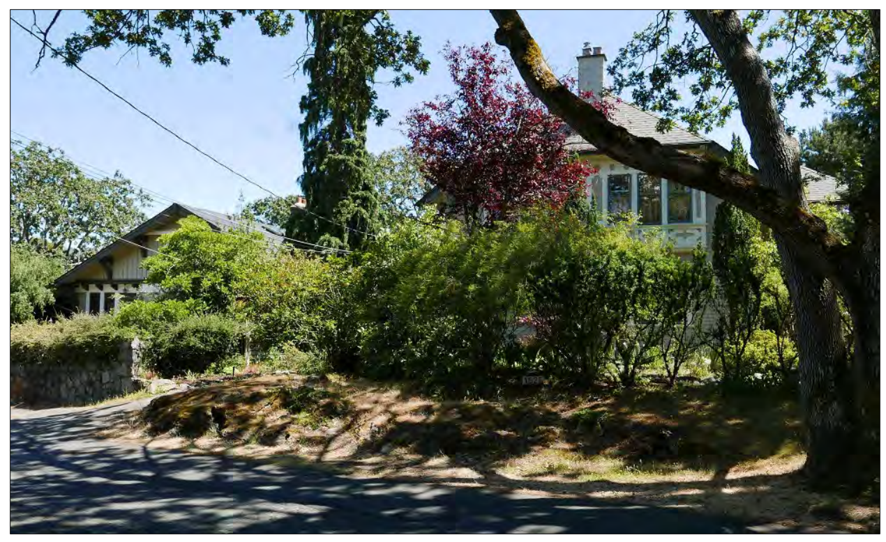
Historic examples of siting with large, front setbacks.