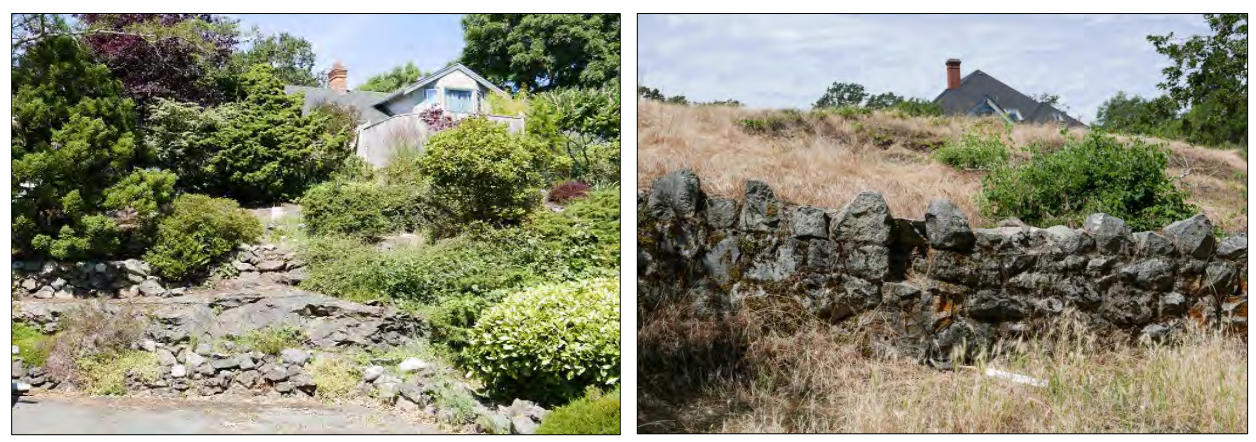
Terraced retaining walls that incorporate plantings and respect the natural topography.