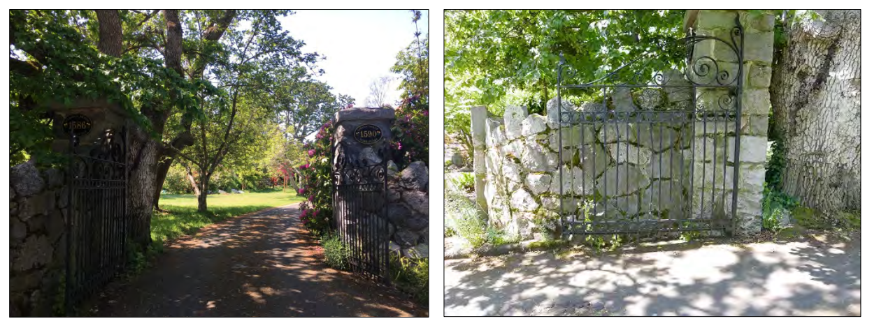
Stone wall and wrought iron gate belonging to the garden of The Gibson House property, demonstrating the use of traditional materials that help define the character of the neighbourhood.