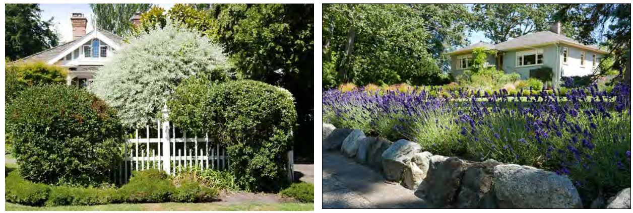
Examples of screening and layering with natural vegetation.