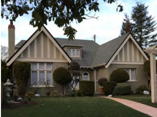
One of the Storybook houses at Patio Court on San Carlos Avenue.