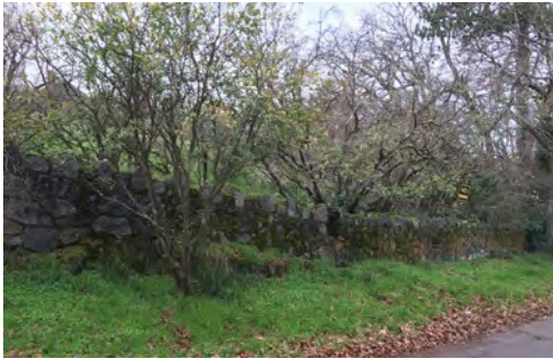
Prospect Place stone wall with natural vegetation.