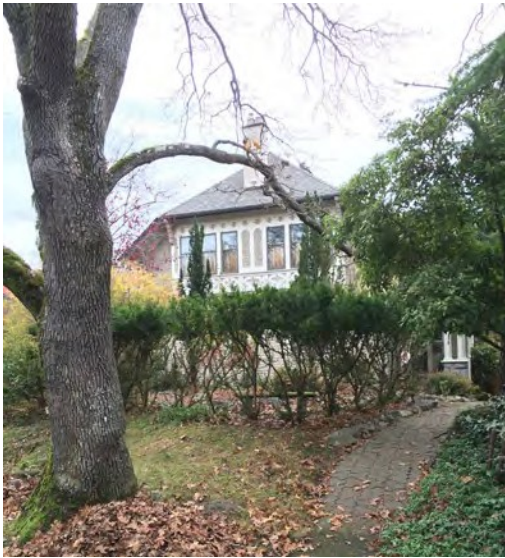
A Rattenbury designed Shingle and Tudor Revival home.

Originating in 1858 with politician and surveyor Joseph D. Pemberton's survey of Oak Bay and evolving up to the present day, the area has historic value as part of the pattern of growth of the Oak Bay community in the late 19 th century. It charts the evolution of the area from Pemberton's large estate subdivision and farm to a unique leafy garden suburb. It provides an understanding of the upper classes of Victoria society, first as a beachside resort destination and later as an aesthetically pleasing and high quality residential neighbourhood.