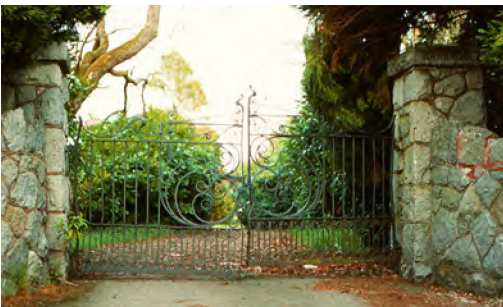
Wrought iron Art Nouveau gates at Annandale.

As designed by its British architect-owners, this area of Oak Bay is centered on prominent architect Francis Mawson Rattenbury's c.1898 estate plan, which saw Prospect Place constructed as the original roadway leading through the 15 acre property to Rattenbury's house overlooking the beach. The remaining buildings of Rattenbury's estate – including the Residence, Coach House / Garage, and Boat House – are important for their adaptive reuse and integration into the grounds of Glenlyon Norfolk School.