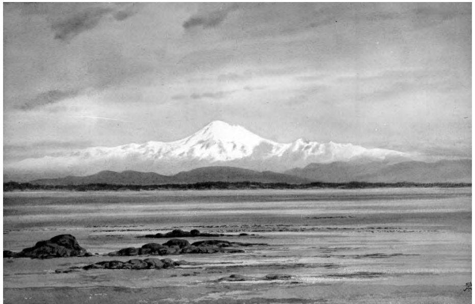
Mount Baker painted by Samuel Maclure, c.1890.