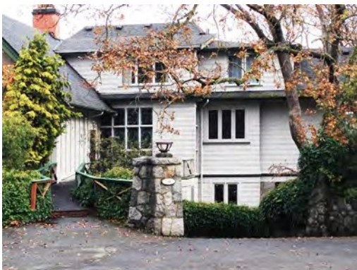
P.L. James designed Beach Drive home built in 1912.

The eccentricity of the streets and lanes that curve, vary in length, or have no outlet are important for their reflection of the early design of this upscale neighbourhood. While originally designed as both a response for the topography and to emphasize the elite nature of the original neighbourhood, these irregular streets form part of the character and charm of the area today.