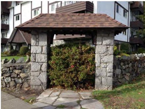
Lych Gate at York Place and Oak Bay Avenue.