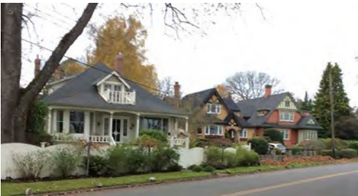
Trio of historic houses along Beach Drive.