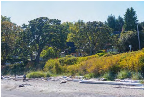
View of Rattenbury's Beach, mature trees and houses on Beach Drive.