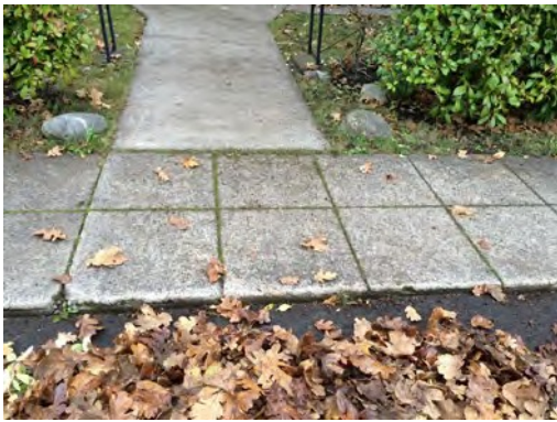
Unique, historic concrete sidewalk with decorative scored pattern.