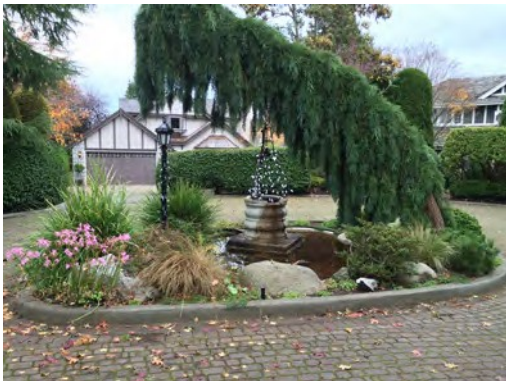
Samuel Maclure designed decorative well-head.