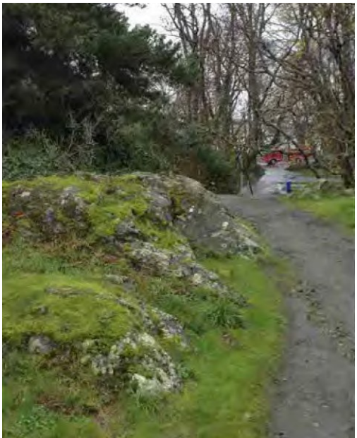
Rock outcrop adjacent to informal pedestrian path.