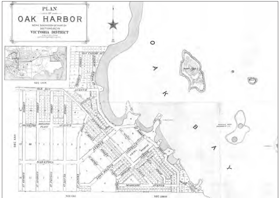
Oak Harbor c. 1891.

The Area: The Early Vision Most of the proposed Heritage Conservation Area is within the original boundary of the larger Oak Harbor development of 1891.