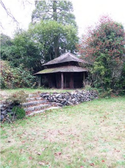
Samuel Maclure designed summer house overlooking site of former tennis court.