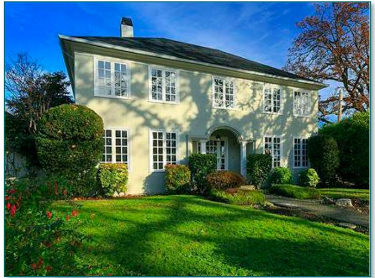
1710 Beach Drive ( previous Commission Review )