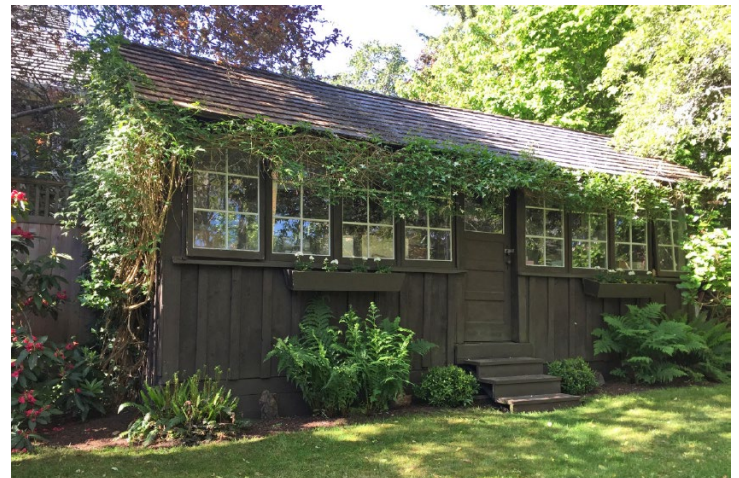
1670 Prospect Place – Accessory Building