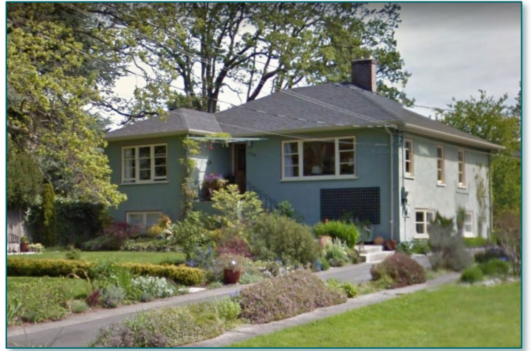
1545 York Place