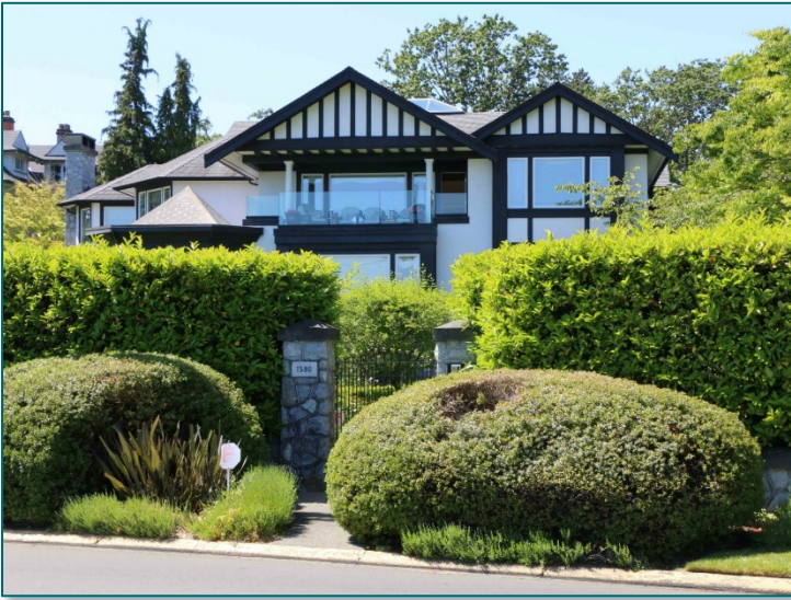
1580 Beach Drive ( previous Commission Review )