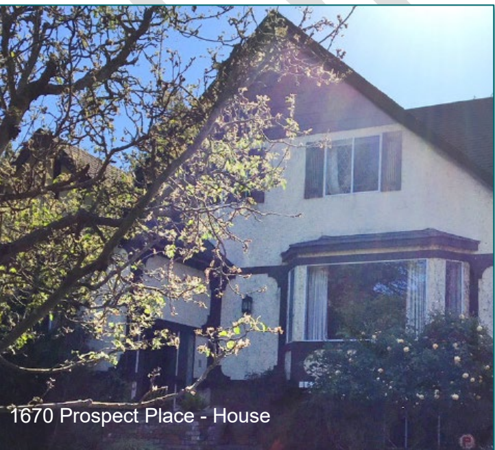
1670 Prospect Place - House