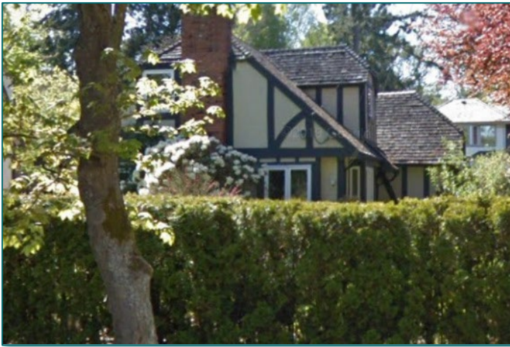
1680 Prospect Place ( previous Commission Review )