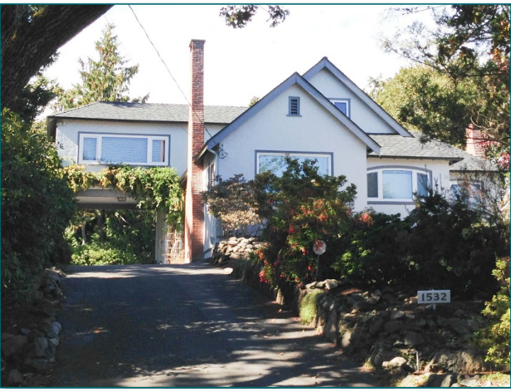
1532 Prospect Place ( previous Commission Review )